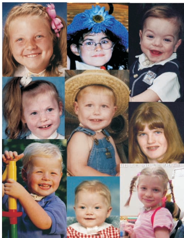
Figure 1. Composite of casual photographs from children with CCHS. These casual photographs of children with CCHS are examples of the photos that prompted the authors to consider a characteristic facies in CCHS.

develops into facial structures or viscerocranium (12,13). Further, the original neuraxial order of the rhombencephalic neural crest is strictly maintained throughout development of the viscerocranium (14), such that skeletal muscle connective tissue arising from a specific neural crest rhombomere exclusively attaches to neural crest–derived skeletal structures from the same rhombomere, leading to strictly conserved musculo-skeletal patterning (14). These observations led to the hypothesis that the CCHS facial appearance could be quantified, and is related to the presence of a mutation in the neural crest–defining PHOX2B gene, with severity of the facial patterns proportional to the number of polyalanine repeats.